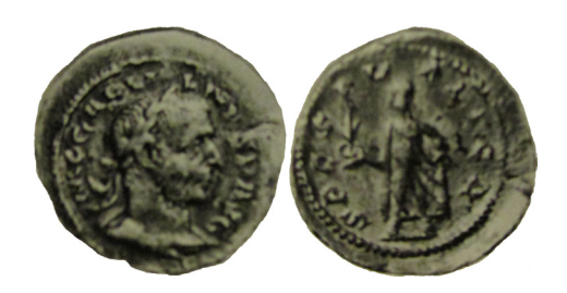
Fig. 8 Quinarius

I do not really like papers which generate more questions than they actually answer. But this time I might do the same. Personally, I am convinced that the coin at hand was minted due to monetary reasons, however, I would not like to start guessing about the reason it was minted. Nevertheless, I think it is worthwhile to mention here István Vida's idea, who was great help to me during the whole research. The title of this article used to be 'A mysterious Gallienus as with SPES PVBLICA reverse'. Then he checked all Viminacium provincial sestertii preserved in the Coin Cabinet of the Hungarian National Museum. 113 coins struck under the