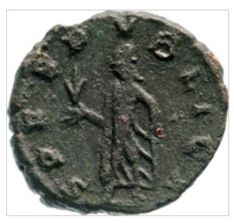
Fig. 1 The third specimen

DOI: https://doi.org/10.37790/anh.2019.6