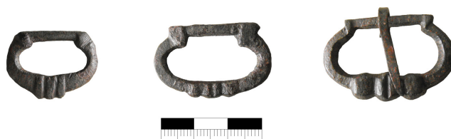
Fig. 6.

The rest of the buckles are oval-shaped and single-sided, with moulded front. ( Fig. 6 ) Similar buckles are known from several late medieval sites. One specimen in the collection of the National Museum was dated by Zsuzsa Lovag to the early 14 th century. 19 A similar D-shaped buckle is known from 15–16 th century layers in the castle of Buda. 20 This type appears also in the castle of Ozora 21 and a graveyard in Nagytálya. 22