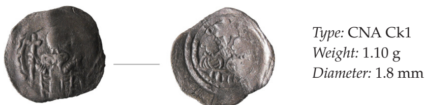
Fig. 2.

One of the stray finds is a silver Friesacher pfennig struck in the mint of Rann (today Brežice, Slovenia) by the Archbishop of Salzburg Eberhardt II. (1200–1246) along with the Duke of Austria, Leopold VI. (1198–1230) ( Fig 2 ).