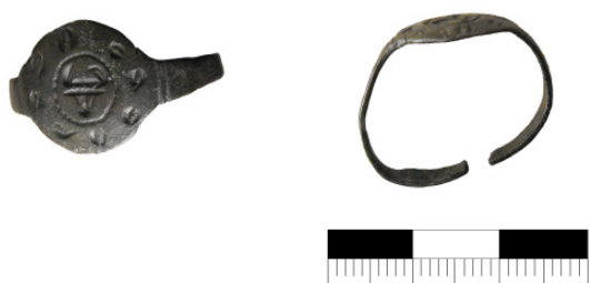
Fig. 4.

The second ring is made of bronze. (Fig. 4) Similarly to the previous one, it was hammered from a single band. On the bezel there is the head of an ox engraved. Around the main figure