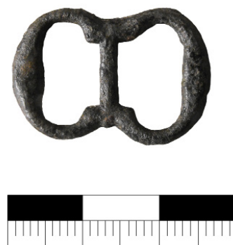
Fig. 5.

The four buckles were all cast of bronze. One of them is a double-sided spectacle buckleframe. (Fig. 5) The rear face is flat, the prong is missing. Similar double-sided specimens appear in cemeteries from the 13 th century on. 16 The closest analogy of the Kisnémedi specimen is known from Buda castle. 17 Based on the stratigraphic contexts it can be dated to the 14–15 th century. A similar buckle, with hoops lengthened into an edge was found in a goldsmith's yard in Visegrád, from the early 15 th century 18 .