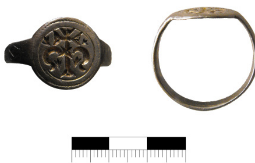
Fig. 3.

The two rings among the finds are both hammered, bearing engraved ornaments on the bezel. The more delicate piece of the two is made of silver, and has the traces of gilt remaining in its decorations. ( Fig. 3 ) On the bezel one can see a cross combined with lily and floral decorations. 11 The design is definitely of high quality. The lines of the engravings are clear and deep, the design of the figure is fairly symmetric. The figure does not fill the whole bezel, but around the ornament there is an inner circle, and another beaded circle just by the edge of the bezel. On the two sides of the hoop, where it connects to the bezel, one can see geometric ornaments. These frame decorations were engraved in a much lighter way than the main design. Despite the fine execution of the central figure the framing shows prominent flaws. The inner circle was meant to be made of two semicircles, but the two didn't connect to each other as they ought to have. Considering the void space between the inner and the exterior frame circles, the artificer may have planned to make a legend, but for some reason – maybe because of the malformation of the inner circle or the small space – it did not come to fruition. Despite its flaws, the ring must