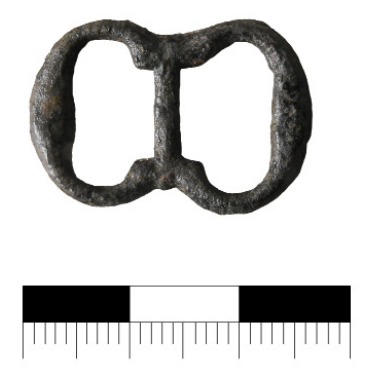
Fig. 5.

The four buckles were all cast of bronze. One of them is a double-sided spectacle buckleframe. ( Fig. 5 ) The rear face is flat, the prong is missing. Similar double-sided specimens appear in cemeteries from the 13<sup>th</sup> century on. <sup>16</sup> The closest analogy of the Kisnémedi specimen is known from Buda castle. <sup>17</sup> Based on the stratigrafic contexts it can be dated to the 14–15<sup>th</sup> century. A similar buckle, with hoops lengthened into an edge was found in a goldsmith's yard in Visegrád, from the early 15<sup>th</sup> century <sup>18</sup>.