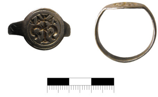
Fig. 3.

The more delicate piece of the two is made of silver, and has the traces of gilt remaining in its decorations. ( Fig. 3 ) On the bezel one can see a cross combined with lily and floral decorations. <sup>11</sup> The design is definitely of high quality. The lines of the engravings are clear and deep, the design of the figure is fairly symmetric. The figure does not fill the whole bezel, but around the ornament there is an inner circle, and another beaded circle just by the edge of the bezel. On the two sides