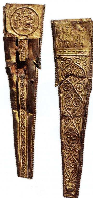
Fig. 5. Brass mount of a dagger (or knife [?]) scabbard with „oath scene” (Museum of Sopron, Inv. Nr. 55.111.1., 55.148.1. After TAKÁCS-TÓTH-VIDA 2016, Cat. III/40).