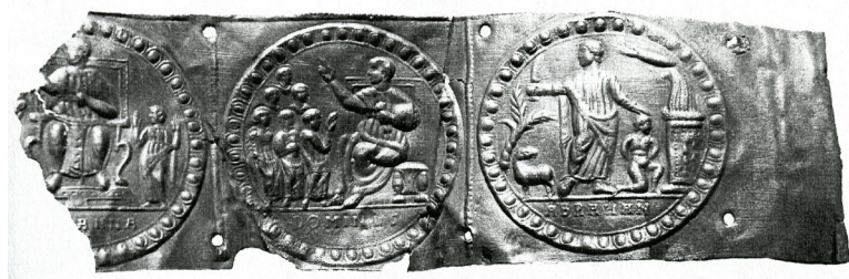
Fig. 4. Fragment of a bronze casket mount with Early Christian scenes from Bakonya-Csucsá-dűlő (After Visy 2015, Fig. 3).