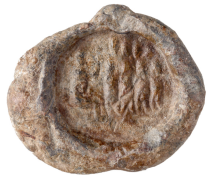
Fig. 1 Late Roman lead seal with „crowd scene” in the Coins Collection of Hungarian National Museum (HNM CC Inv. Nr. 2017.5.1.).